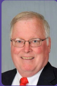
LUMINARIA 2024 DISTINGUISHED ALUMNUS AWARD