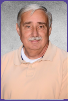
LUMINARIA 2024 DISTINGUISHED EDUCATOR AWARD